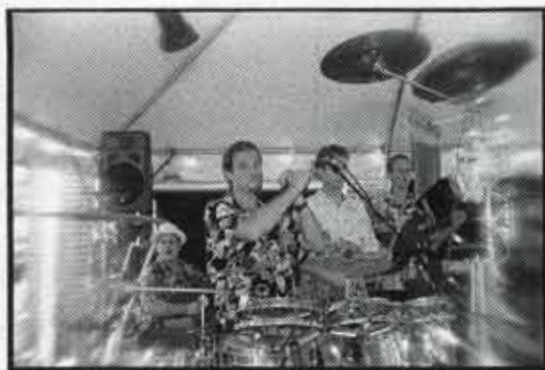
Far left, in the receiving line, the bride, in a Barbara Allin organza gown, sports the white pearlized cat's-eye sunglasses she donned on a dare. Left, Mambo Combo provided the Latin beat for dancing at the tented reception.